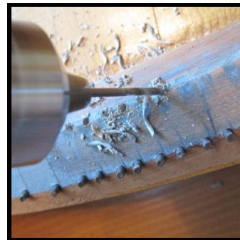
New holes are drilled.

With the bass strings temporarily removed from the bridge and bundled out of the way, the loose bridge pins will be pulled out completely so that the epoxy filler may be used. This epoxy cures rapidly as a result of the chemical reaction to the two components that are mixed together on the spot. Within a short amount of time, the hardened epoxy is ready to sand and drill for the reinsertion of the bridge pins.