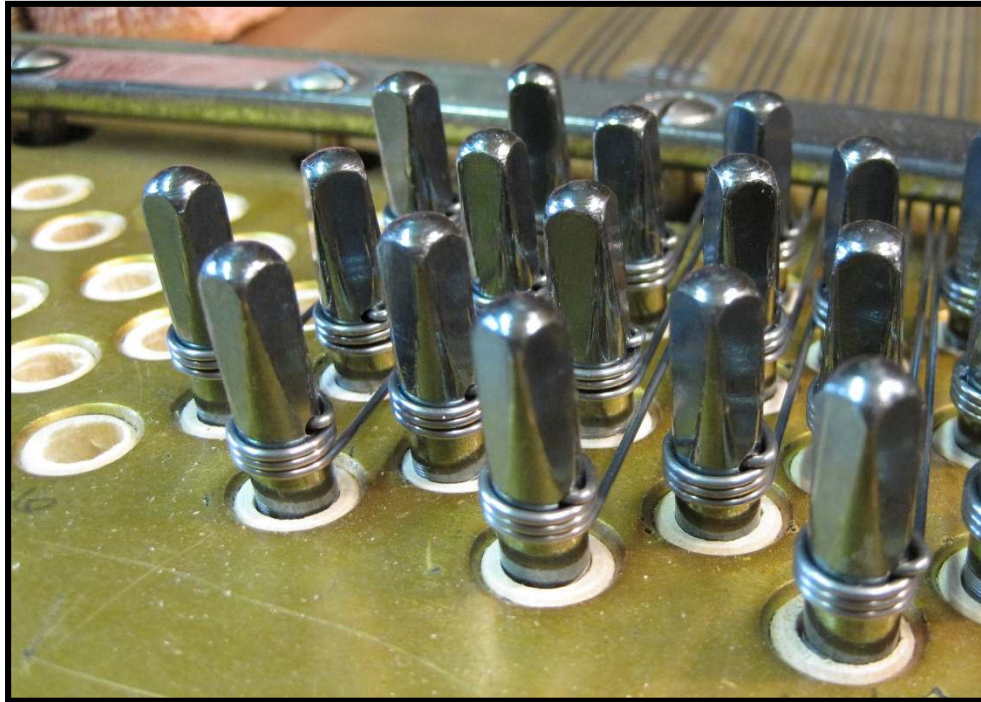
New tuning pins and strings being installed.

For a piano to maintain a stable tuning and sound its best, it is essential that the tuning pins are tight and that the strings are in good condition. When the tuning pins of a piano become loose and tend to slip, the piano will not stay in tune for a reasonable amount of time. When the strings have deteriorated to the point where they are breaking frequently, the tone of the piano will usually suffer as well. Your piano is showing symptoms of problems caused by brittle strings and loose pins which could be lessened or eliminated if your piano were to be repinned and restrung.