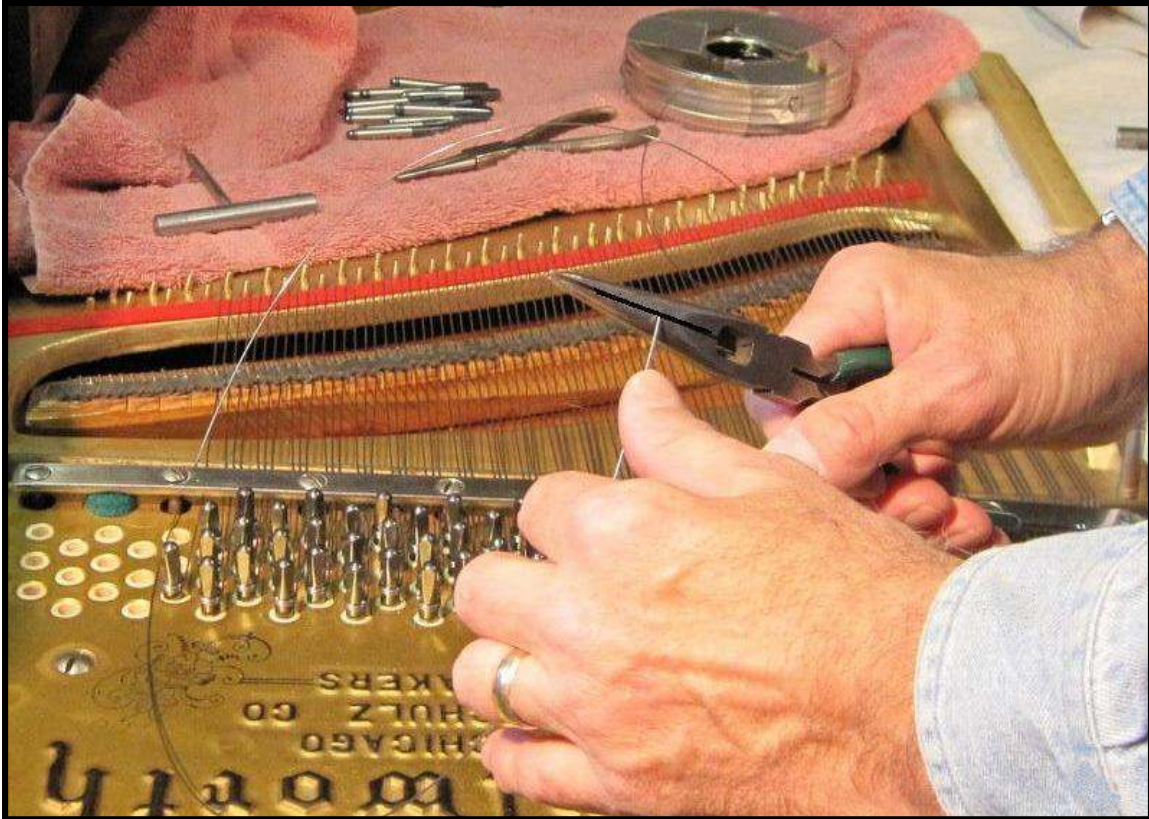
Work in progress on a restringing / repinning job.