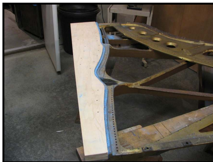
Underside of cast iron plate with new pinblock installed.

Because of the nature of the work involved with this procedure, it would be necessary for the piano to be transported to the workshop.