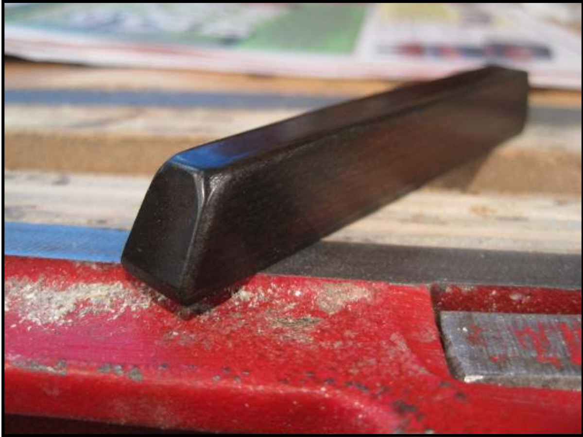
A vintage ebony sharp after stripping and polishing—the warmth of real wood.