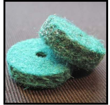
Front rail punchings

The felt used for backrail cloth, as well as the balance rail and front rail punchings, is a very thick, dense felt that is designed to stand up to decades of constant use.