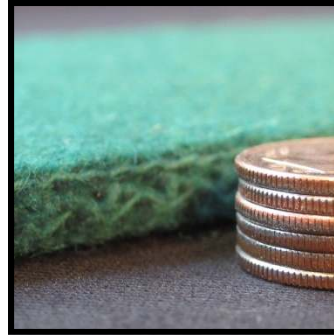
Back rail cloth

As the keybed felts harden and wear thin the keys become uneven in height from note to note. Also the amount of downward stroke (key dip) begins to vary, resulting in an action which has an uneven touch. A perfectly level set of keys with a uniform amount of key dip is essential to a piano action which is performing up to its potential.