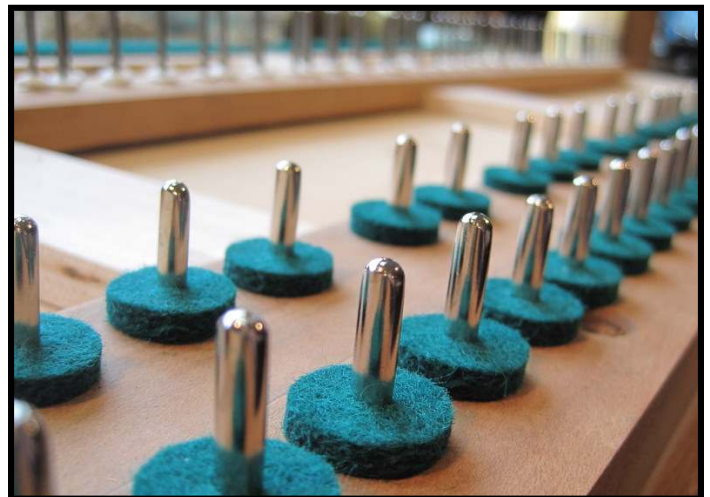
New set of keybed felts in place.

Keybed felts come in a range of thicknesses, so that the original size of the felt installed at the factory may be duplicated. Paper and card punchings as thin as .002" are used under the felts for final adjustments necessary for level keys and even key dip.